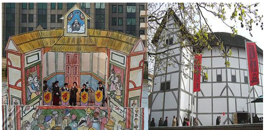
1. Shakespeare's birthday: Tudor music

23 rd April is the day on which the birthday of William Shakespeare (England's most famous writer) is celebrated. Shakespeare's birthday is specially celebrated in Stratford-upon-Avon, the town where he was born. There is a street procession from his birthplace to the church where he was buried and other entertainment with a Shakespearean theme.